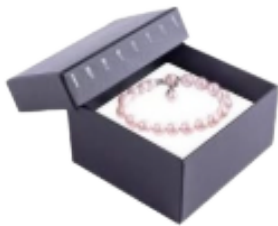
Small Cardboard gift boxes

Christmas often brings extra recycling and 'junk'. Many of these items can be reused. If you have any of the following, please drop them off at the office. Thank you!