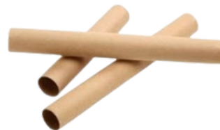
Cardboard sellotape rings, wrapping paper tubes, gift bags/boxes