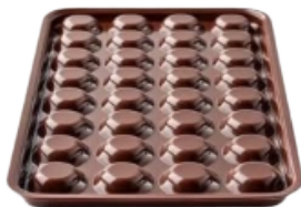
Sweet/biscuit box inserts (plastic trays)