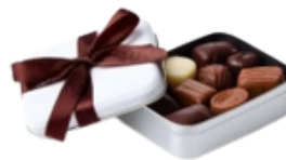
Sweet tubs and tins